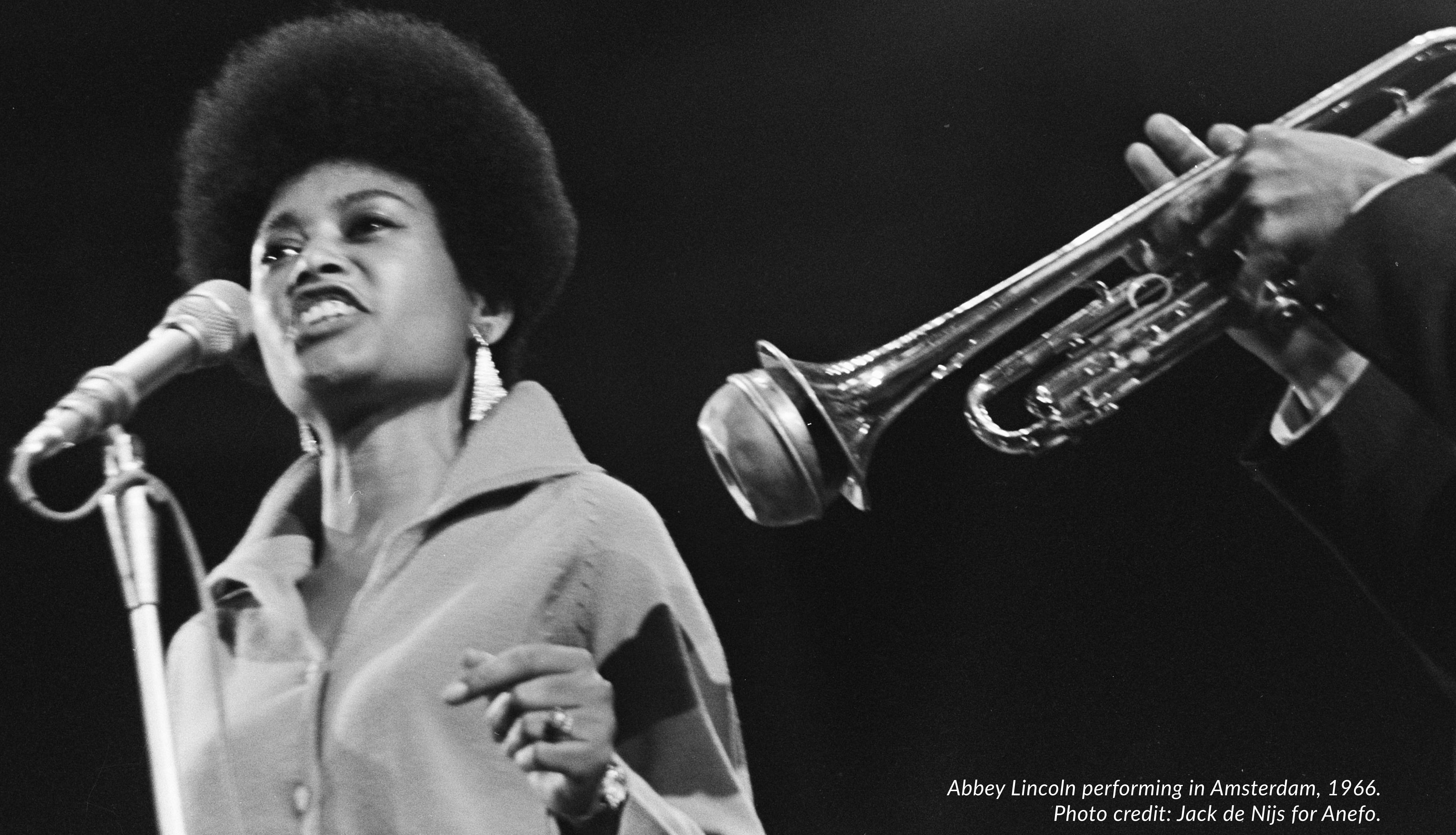
Abbey Lincoln performing in Amsterdam, 1966.

Another thing, your record covers don't do you justice. You're much more interesting in real life."